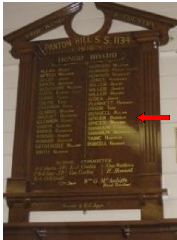
Panton Primary School Honour Board