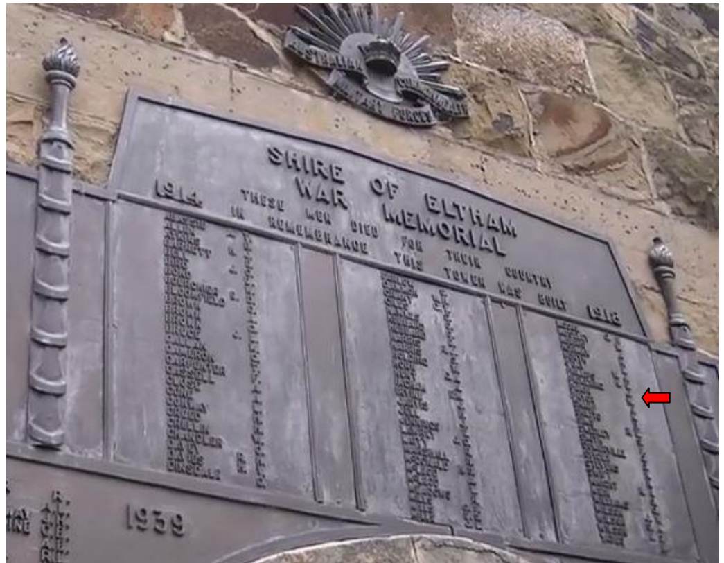
Eltham Memorial Tower